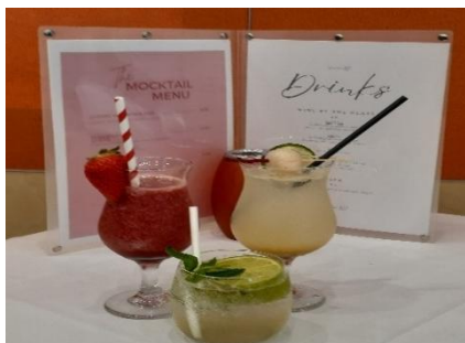
Mocktails offered on entry