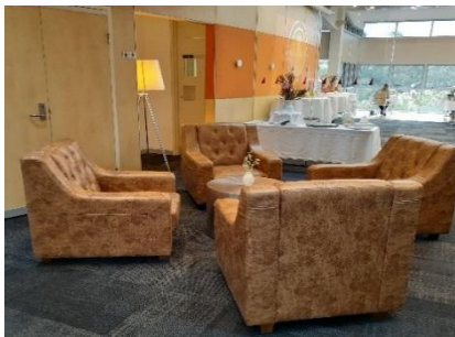
Foyer of Elevation 867

Recently nine members thoroughly enjoyed the ambience, silver service and fine food provided at Elevation 867. All patrons take part in a live class Restaurant experience to witness the skills hospitality students are learning whilst providing them with valuable opportunities to practice their skills on a sympathetic audience.