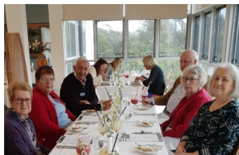
Happy 'class members'