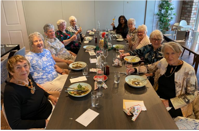
C A B Christmas lunch