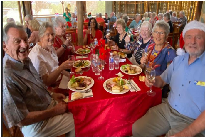
Christmas lunch snaps – thanks to Lorri