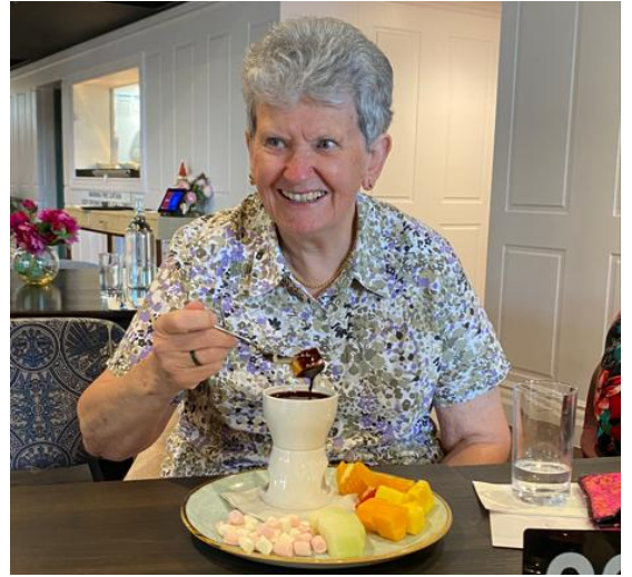
Chocolate fondue – truly decadent!