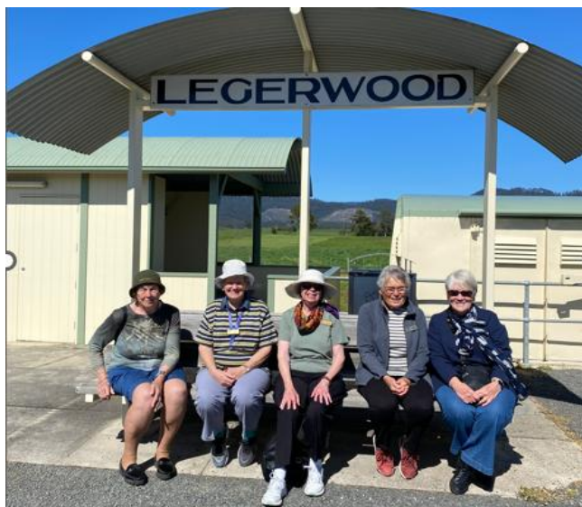
Waiting for the coach (in Tasmania)

Why do we press harder on the remote control when we know the batteries are getting weaker?