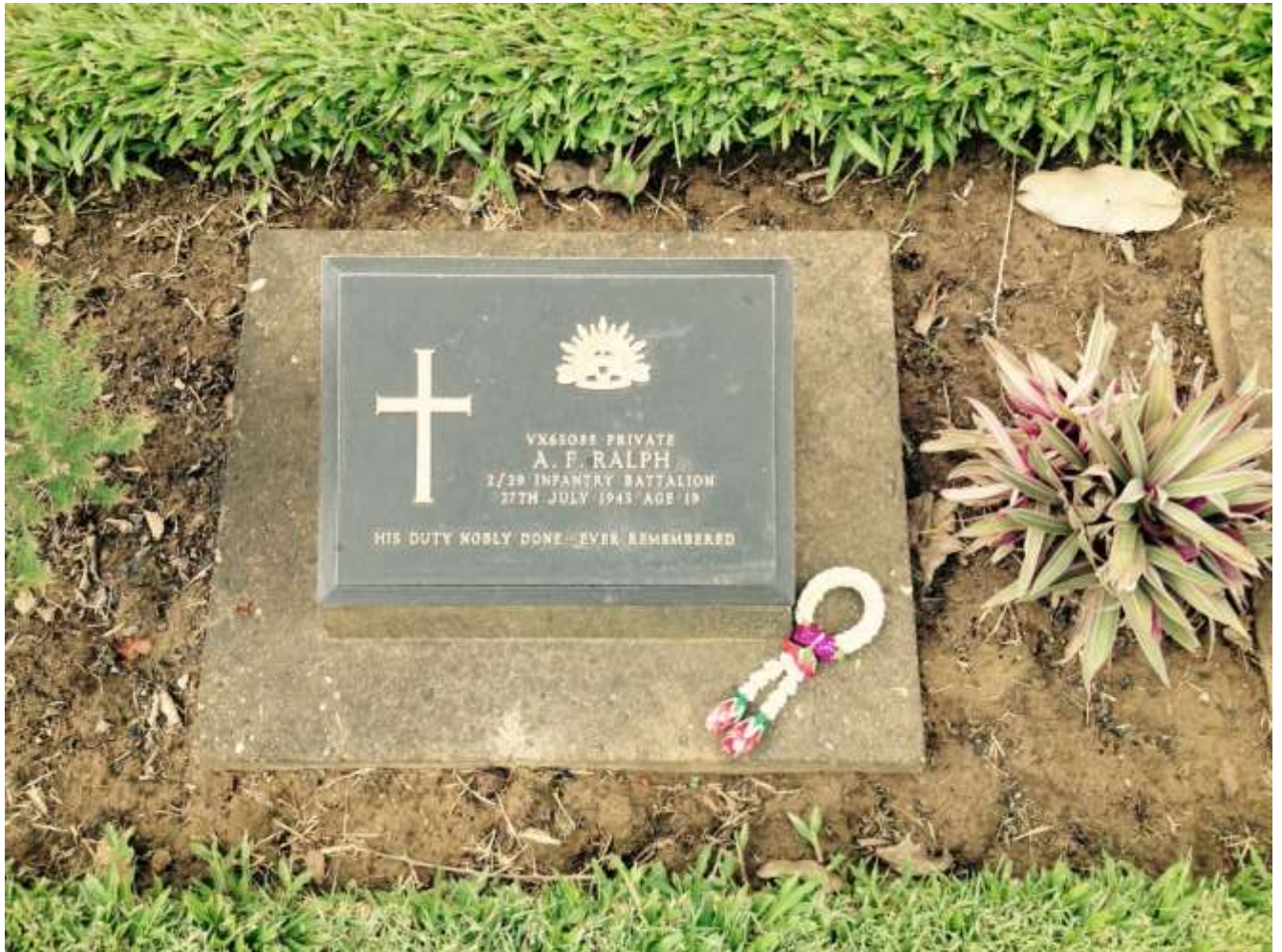
Kanchanaburi War Cemetery Graves from Thai railway.