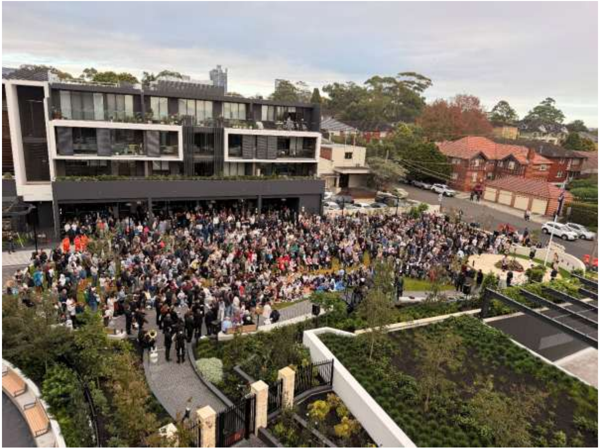
Anzac Day at Club Willoughby.