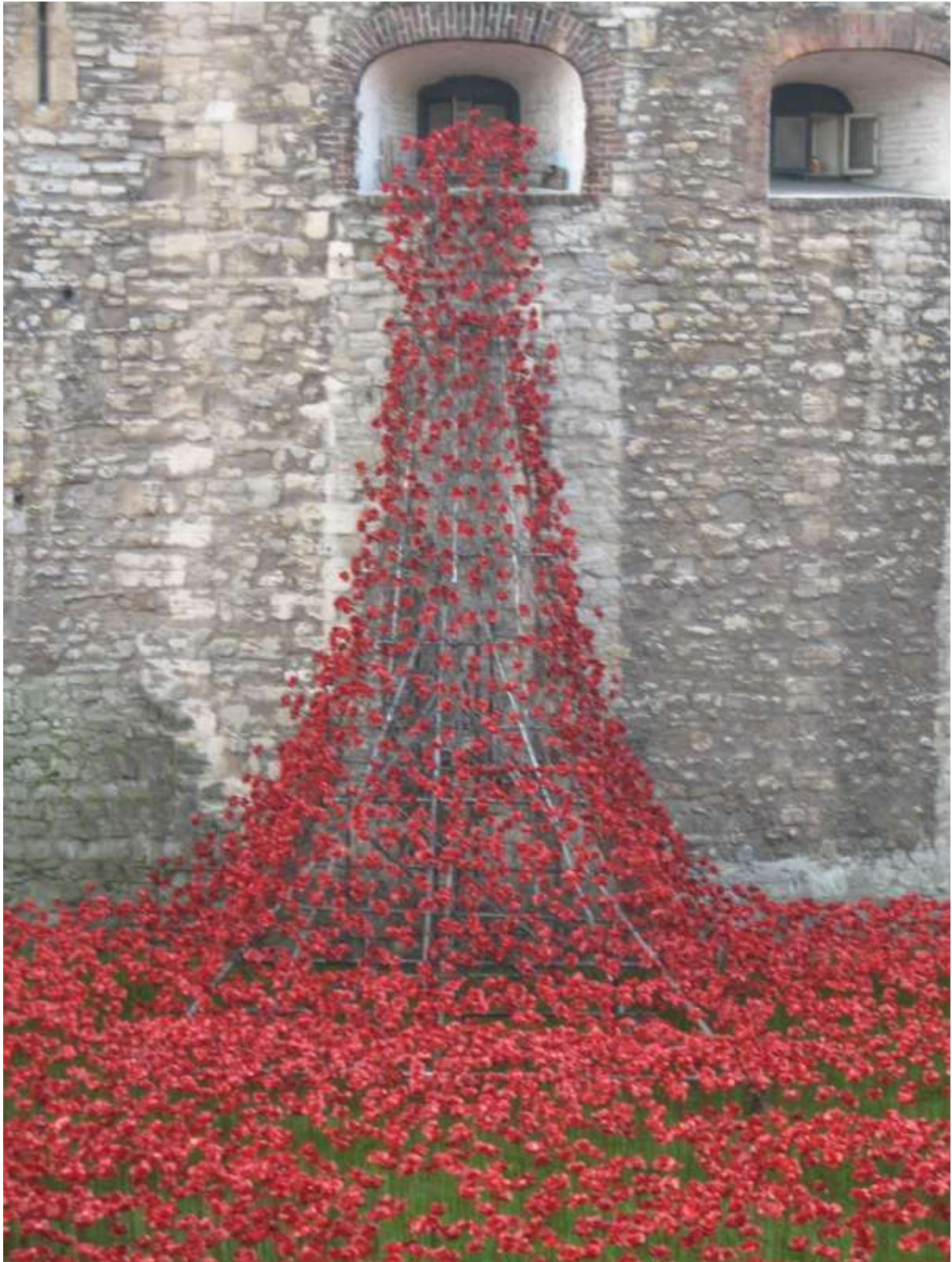
Poppies in the Tower of London moat, 2014.