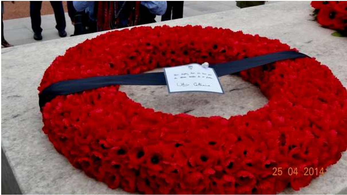
Wreath laid at the Australian War Memorial by Prince William and Princess Catherine, 2014.