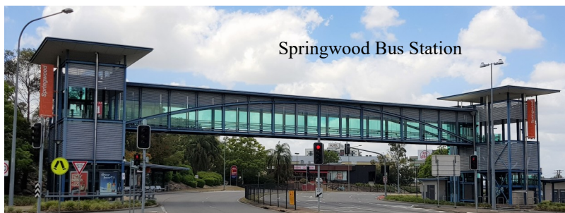
Springwood Bus Station