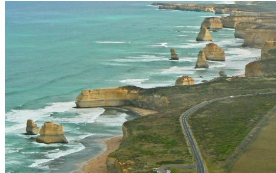
2. This one is easy!