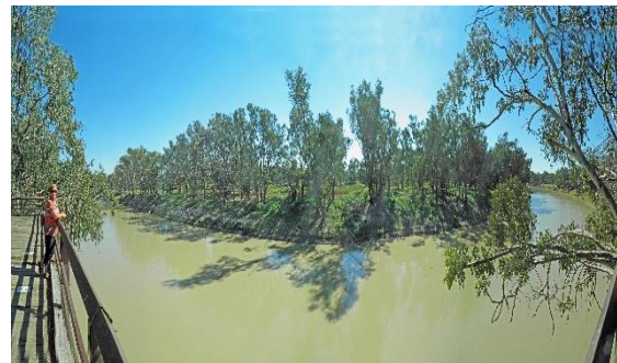
4. Inland Waterway