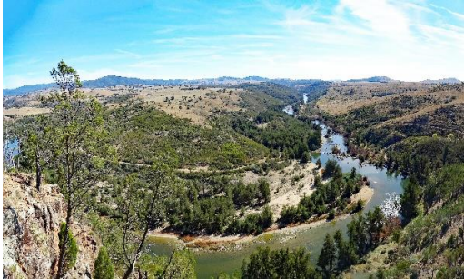
1. Close to home

All these places are in Eastern Australia