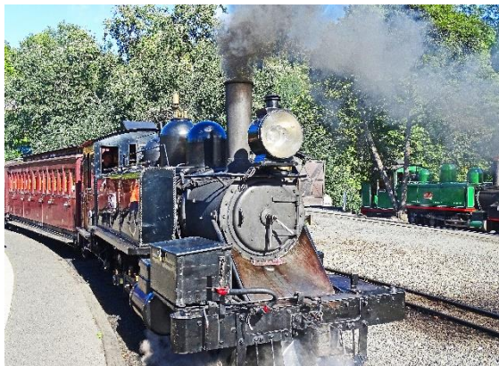
5. A good trip.