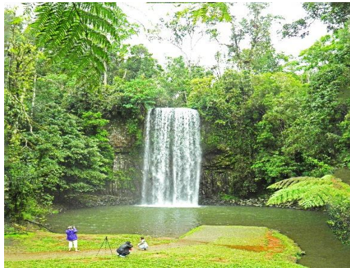
3. In the tropics!