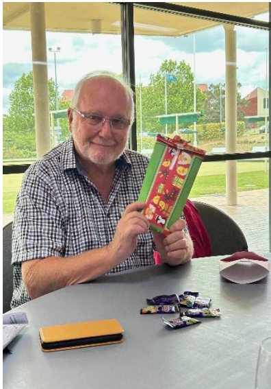
PAUL'S BAG TURNED OUT WELL...