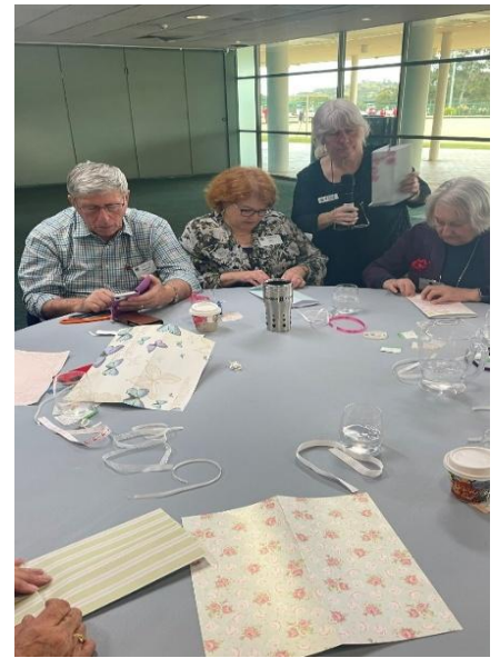
LOTS OF PAPERS & RIBBONS