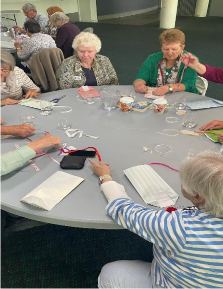
"PASS THE SCISSORS PLEASE"