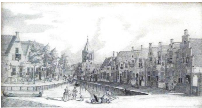
An original sketch of the Waal canal in central Vlaardingen 1743 (original sketch copied by Cees' father in 1974).

The canal through Vlaardingen is an old drainage canal (from before 1250) and is also a shipping route. It is one of the oldest watercourses in Delfland and was created when parts of different creeks were connected by canals using shovels and pick axes.