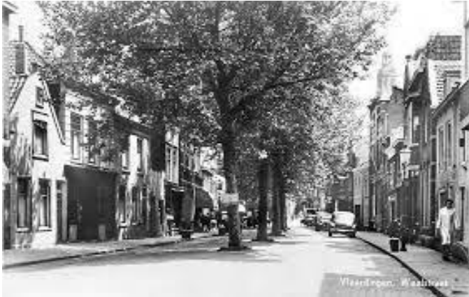
Vlaardingen's Waalstraat in 1960

Vlaardingen is one of the oldest inhabited areas of Holland. Between 3,500 B.C. and 2,500 BC. The area was already inhabited. However, the area looked very different than it does today.