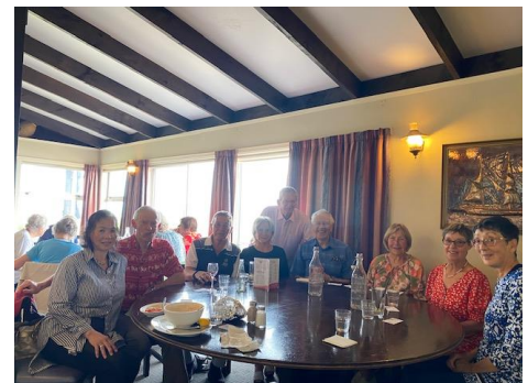
Lunch group at Fisherman's Table in February