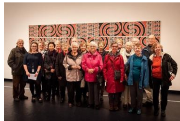
Club members on the visit to The City Gallery 16 th October