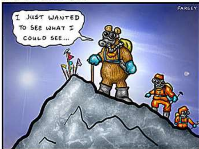
Why the bear climbed Mount Everest.