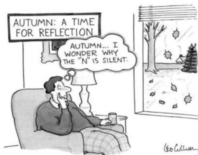
Leo Cullum— Autumn: A time for reflection