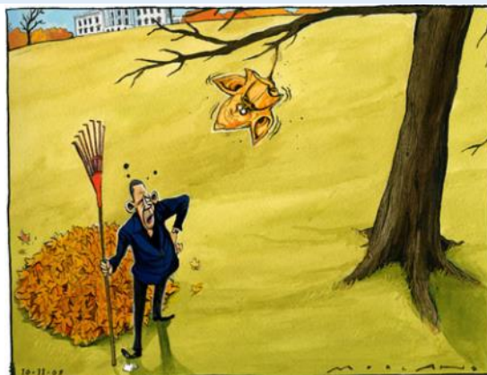
Poldraw Autumn Leaf 2