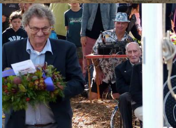
Peering around the flagpole